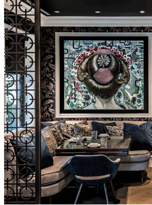
Private lounge at Chase Hospitality Group's Kasa Moto, conceived by Toronto's II BY IV Design.

We're really excited about our new steakhouse opening up in Casa Loma. It's been an arduous process to make sure it's done properly. We'll be open by February 2017.