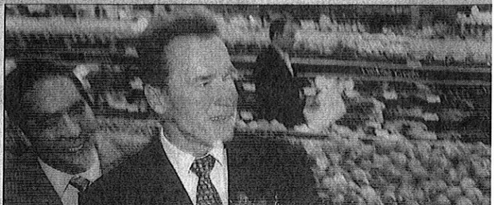
6:43 p.m. Enjoying a glass of wine at the Queen's Quay LCBO.