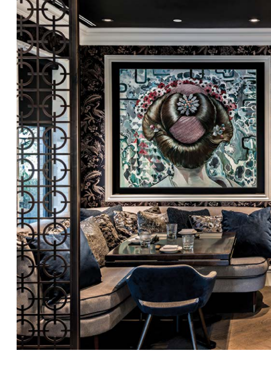
Private lounge at Chase Hospitality Group's Kasa Moto, conceived by Toronto's II BY IV Design.

We're really excited about our new steakhouse opening up in Casa Loma. It's been an arduous process to make sure it's done properly. We'll be open by February 2017.