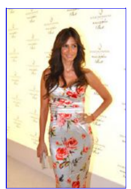
See Faces & Places!