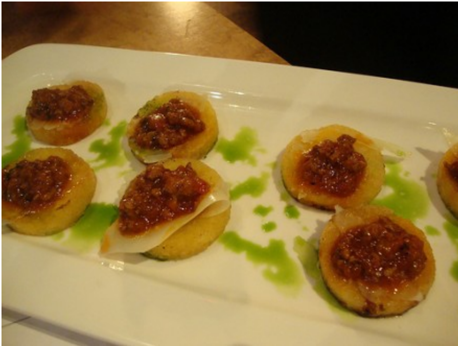
Crispy Polenta with bolognese

Soon after, guests were spoiled to a generous amount of hors d'oeuvres — Caprese Spidini; Assorted Bruschetta; Calamari fritti with garlic aioli and spicy marinara dips; Crispy Polenta with Bolognese — we were spoiled from the moment we walked in and the hors d'oeuvres got better with every bite that we took.