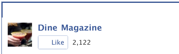
Dine Magazine on Facebook